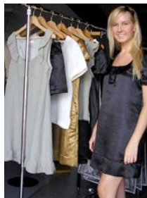
Image of designer with collection (one high-resolution digital image 300dpi 1MB or above PLUS one low-resolution 6x8cm 72dpi 300KB or below)

Image of each item in the collection or a representation thereof, preferably laid out on a plain white background (one high-resolution digital image 300dpi 1MB or above PLUS one low-resolution 6x8cm 72dpi 300KB or below)