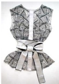
Image of each item in the collection or a representation thereof, preferably laid out on a plain white background (one high-resolution digital image 300dpi 1MB or above PLUS one low-resolution 6x8cm 72dpi 300KB or below)

Your LABEL LOGO and the following IMAGES in digital and print format must accompany this application: